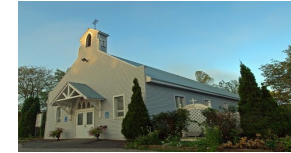
St. James the Great