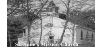
St. Anne's Mission Church