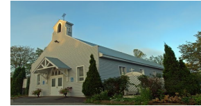
St. James the Great

St. James the Great (MacTier) 509 High St. Sunday 11:00 am