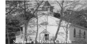
St. Anne's Mission Church