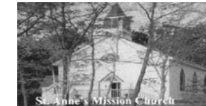
St. Anne's Mission Church