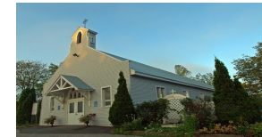
St. James the Great