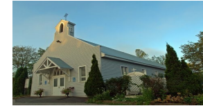
St. James the Great

St. James the Great (MacTier) 509 High St. Sunday 11:00 am