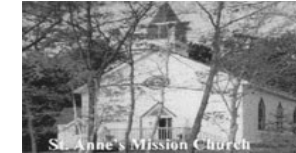
St. Anne's Mission Church